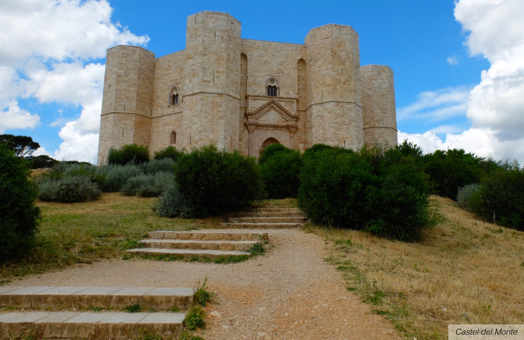
Castel del Monte