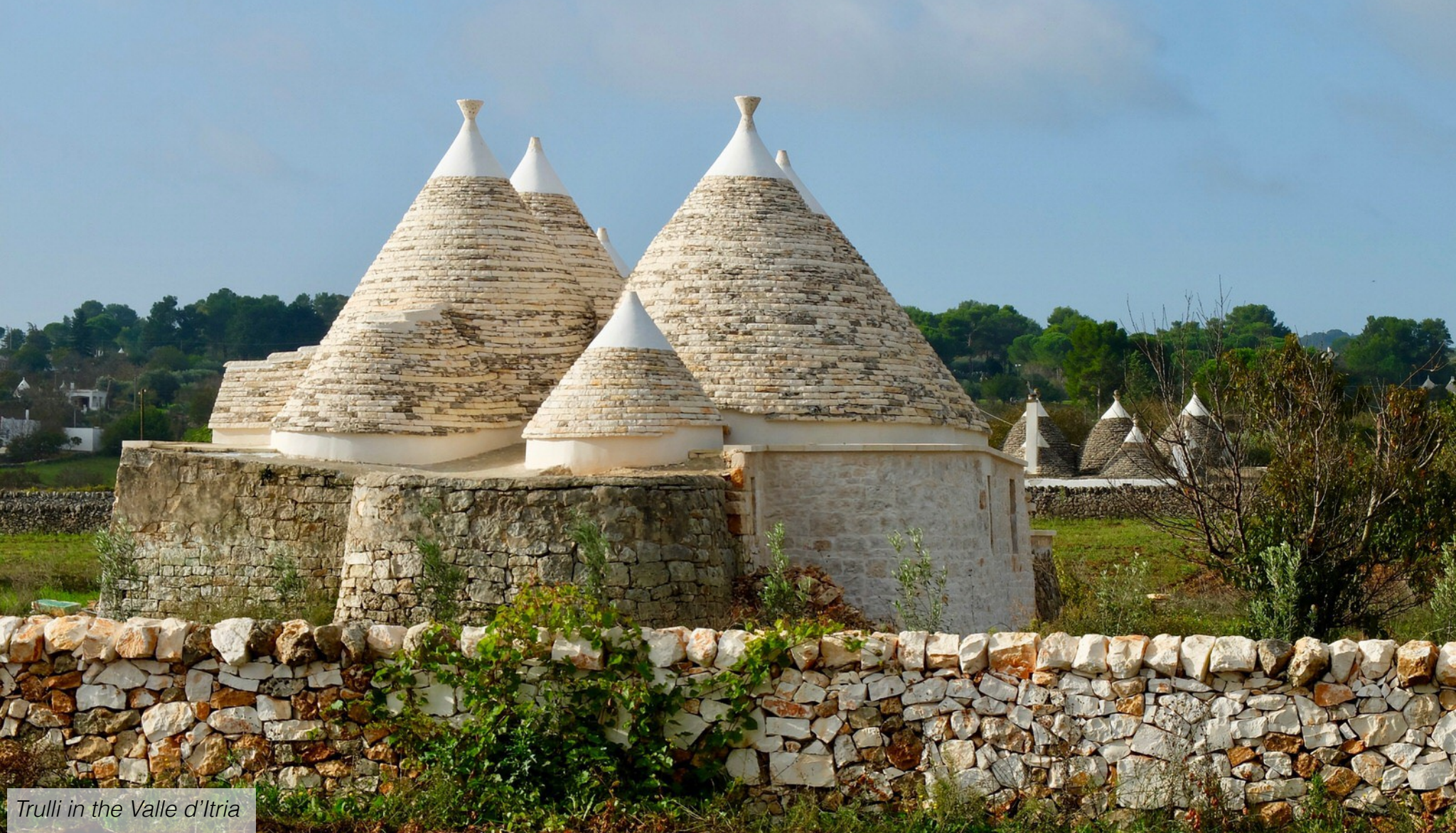
Trulli in the Valle d'Itria